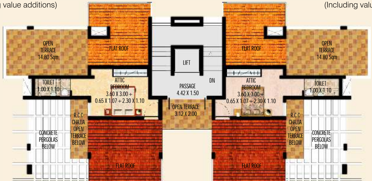
ATTIC FLOOR PLAN ( penthouse attic level )